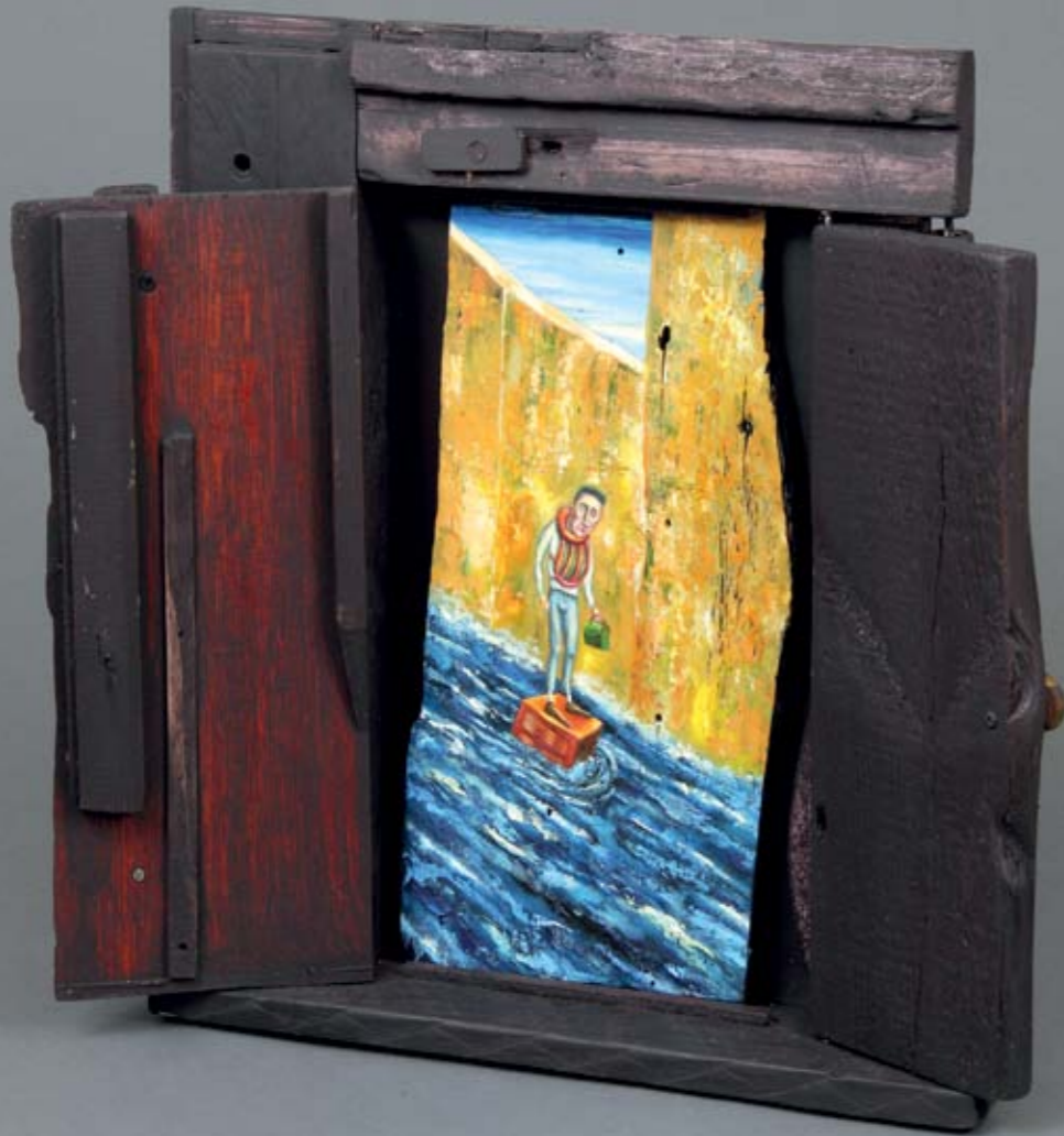
When the flood comes

Oil on wood & found objects 47 x 42 x 8 cm