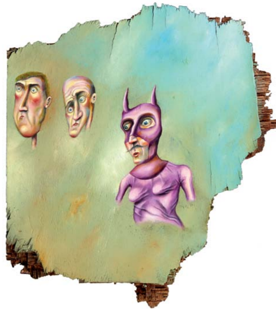
A Batman with tits was bound to generate controversy