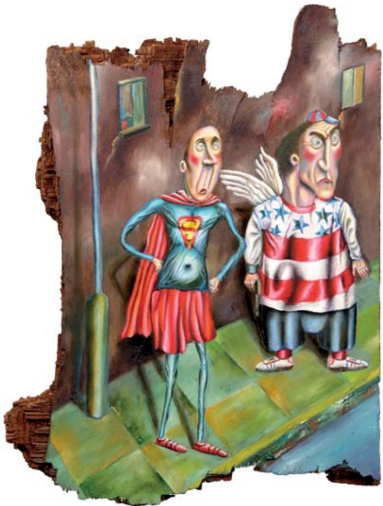
Superman and an angry angel