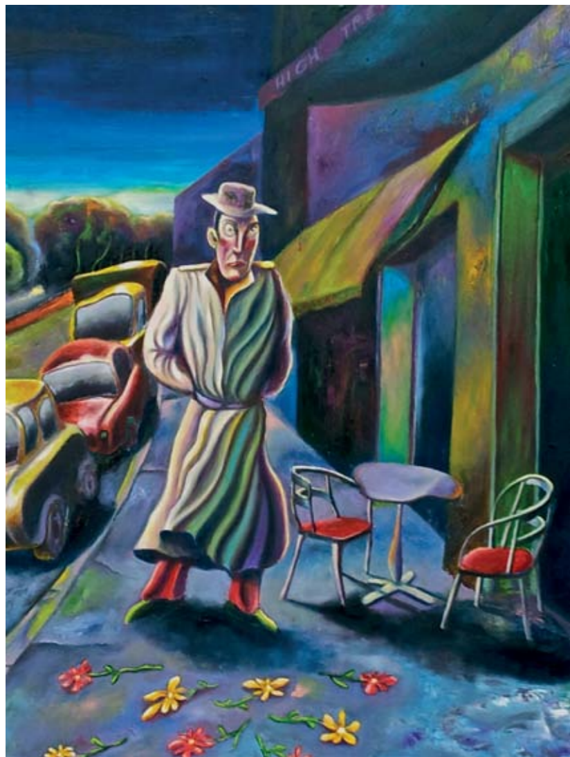
Mary and Joseph