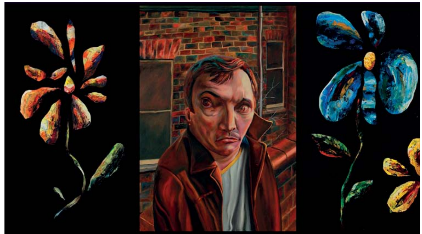
The man with no name Oil on wood and found objects 70 x 140 x 5 cm