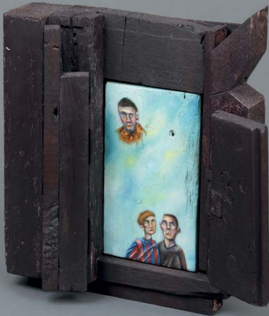
A father's fear for his two sons, the goalkeeper and the defender

Oil on wood & found objects 34.5 x 29.5 x 8 cm