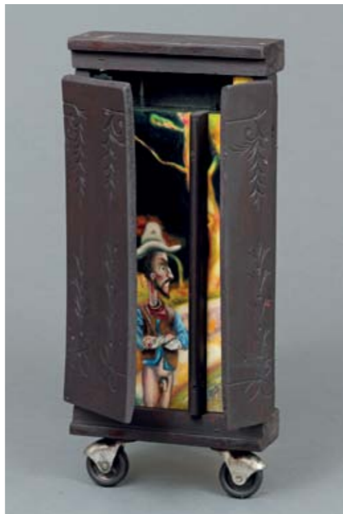
Midnight Cowboy Oil on wood & found objects 34.5 x 16 x 5 cm