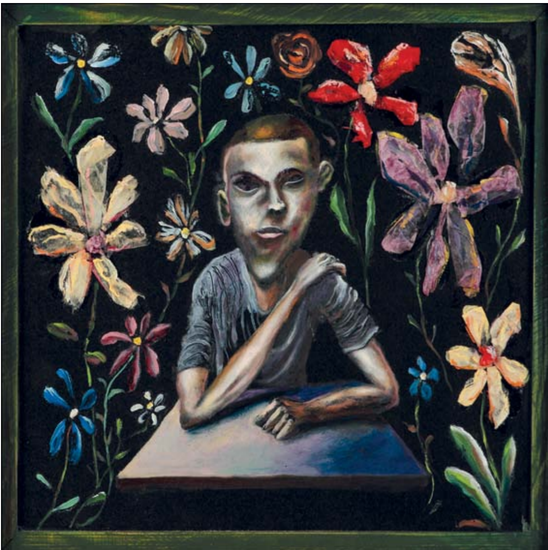
Boy with Flowers Blind Reader 1

Oil on wood and found objects 25 x 25 cm