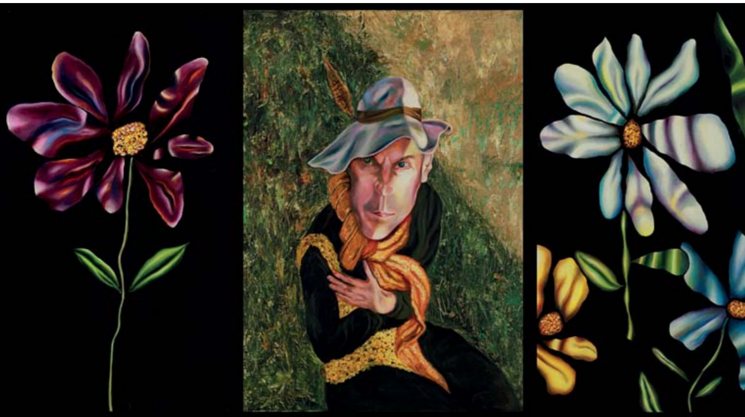
Lady Chatterley Oil on wood and found objects 70 x 140 x 5 cm