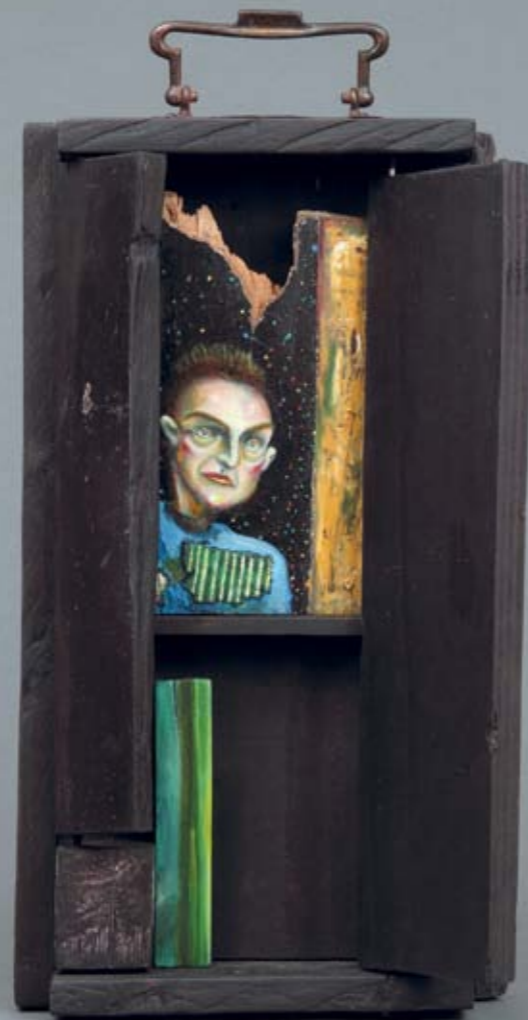
If you take me, I'll respond

Oil on wood & found objects 42 x 24 x 8 cm