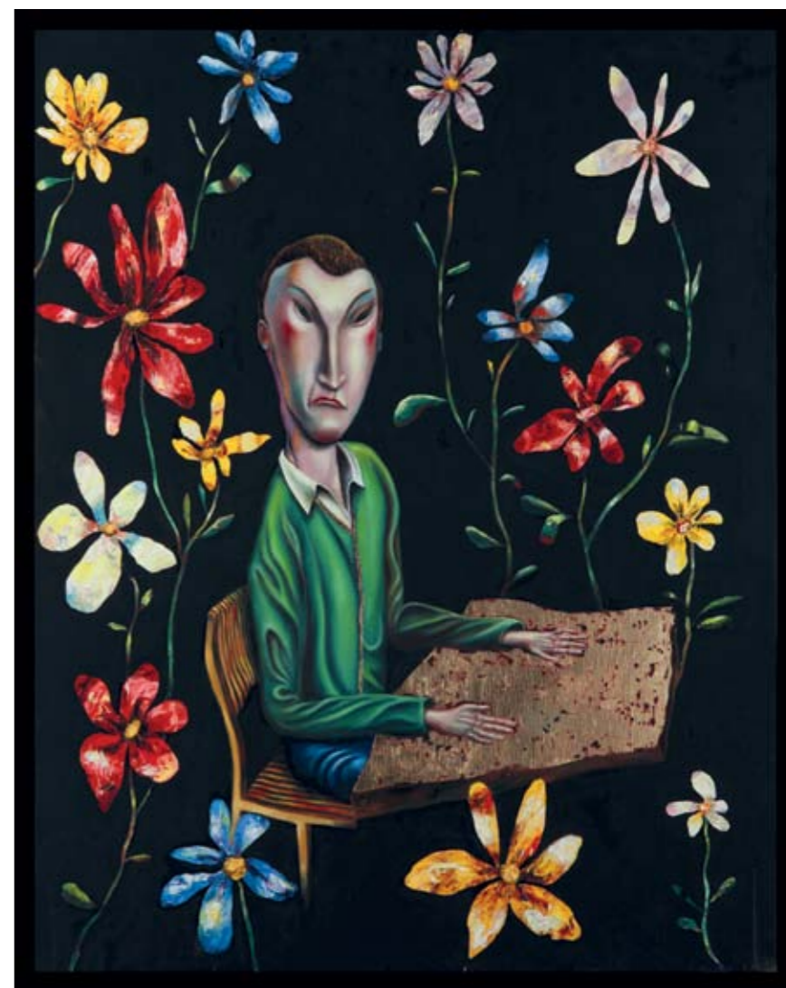
Blind Reader Tryptich (detail)

Oil on wood and found objects 25 x 25 cm