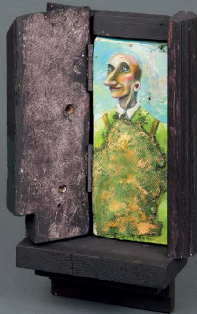
Man in green apron

Oil on wood & found objects 42 x 24 x 8 cm