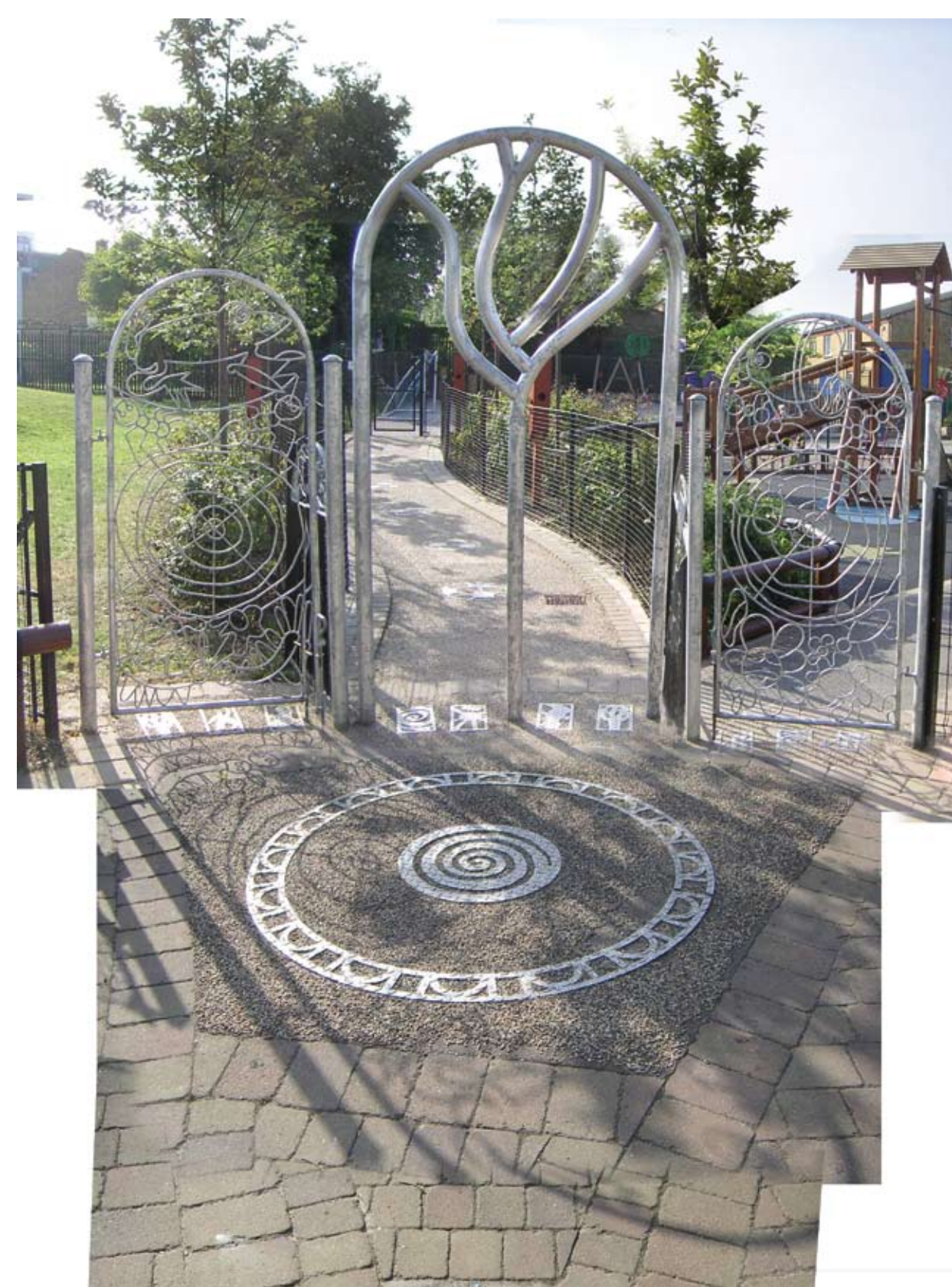
Haymerle Special School