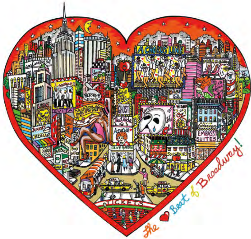
The Heartbeat of Broadway

Limited edition 3D silkscreen Serigraph 45 x 47 cm