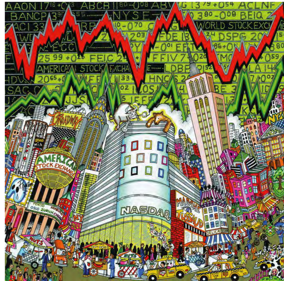
Bears a Hangin' bulls a Chargin'

Limited edition 3D silkscreen Serigraph 73 x 65 cm