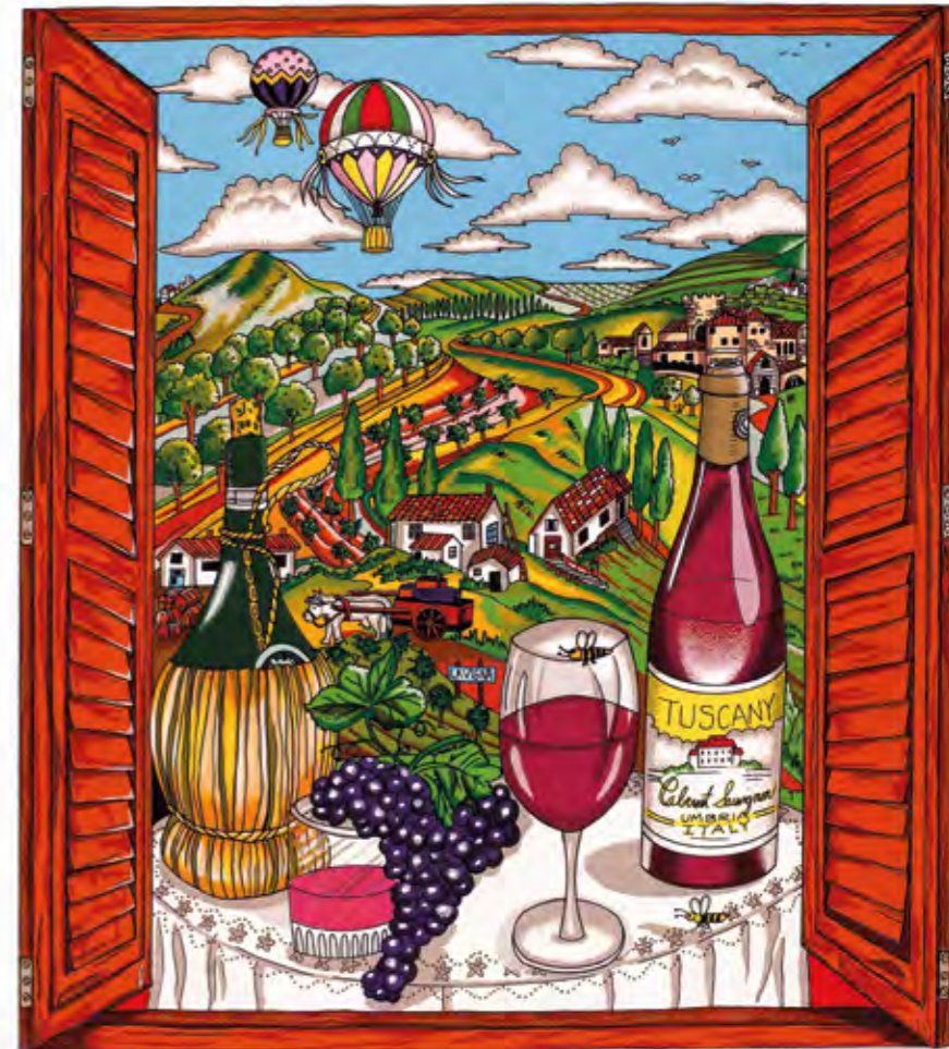
Il Buono Vino della Toscana

Limited edition 3D silkscreen Serigraph 82 x 82cm