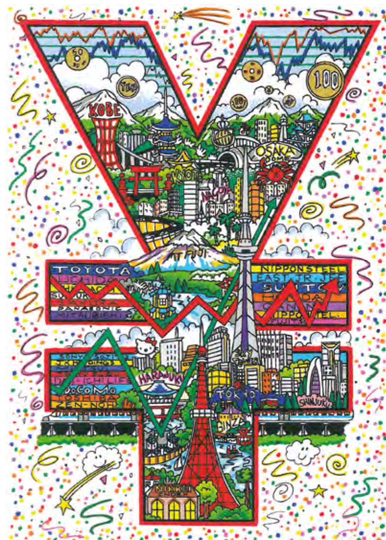
We're in the Money: Yen

Limited edition 3D silkscreen Serigraph 45 x 47 cm