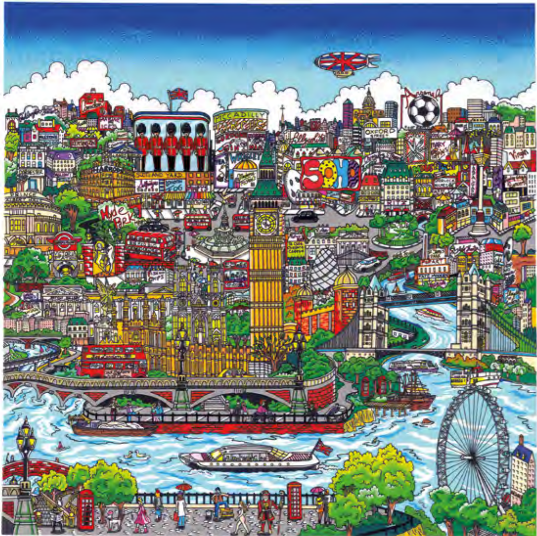
Touchdown in London Town

Limited edition 3D silkscreen Serigraph 82 x 82cm