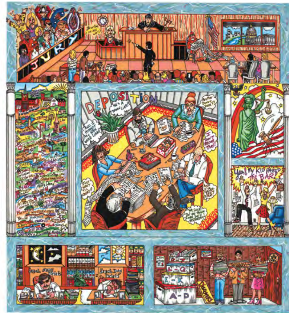
Don't wait, Litigate!

Limited edition 3D silkscreen Serigraph 43 x 43 cm